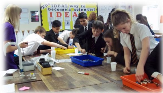
“Clippy islands” experiment

Cheney School in Oxford was the final school we visited in Oxfordshire, on 1 st July. Here we had a very busy day, seeing about 540 students, who especially loved our optics experiments run in partnership with the University of Oxford Optics and Photonics Society!