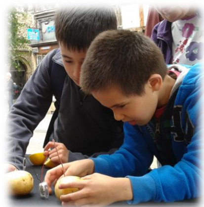
Making "fruit batteries"

First of all, we took some of our experiments to the centre of Oxford for the Big Green Day Out on 4 th June, in partnership with the Oxfordshire Science Festival. Lots of our visitors enjoyed generating electricity by spinning magnets inside copper coils and using fruit to power a clock!