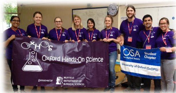
Demonstrators at Cheney School

Cheney School in Oxford was the final school we visited in Oxfordshire, on 1 st July. Here we had a very busy day, seeing about 540 students, who especially loved our optics experiments run in partnership with the University of Oxford Optics and Photonics Society!