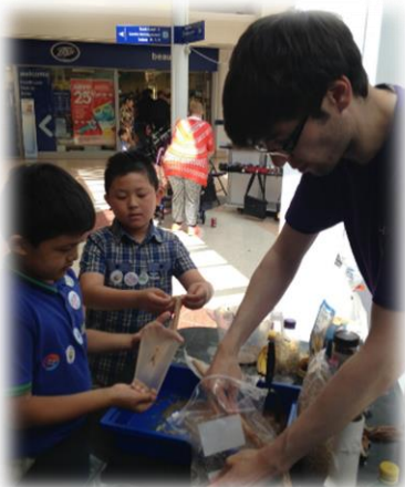
Getting involved with digestion

OxHOS visits schools and public events both in Oxfordshire and further afield in the UK during Roadshows, mainly held during June/July. If you are interested in a visit, request a visit through our website at https://oxfordhandsonscience.wordpress.com/ or get in touch at contact.oxhos@gmail.com .