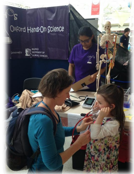
Measuring heart rate

Feedback about our public events was gathered using questionnaires given to groups of visitors. We were very pleased to see that 100% of those who completed the questionnaires would like to come to another OxHOS event. Everyone learned something new, and enjoyed or really enjoyed the event.