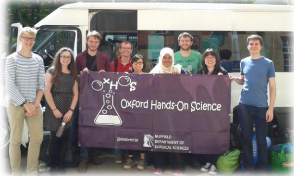
Ready to head off to Wales!

After travelling to South Wales in a minibus packed full of our volunteers and experiments, we set up our campsite and looked forward to a week of school visits!